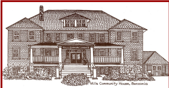
Mills Community House, Benzonia

Saturday, November 12th, 2 P.M. Tickets: $20.00